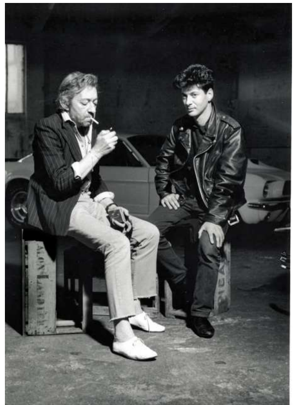
Serge Gainsbourg and Étienne Daho, 1987