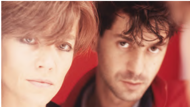
Françoise Hardy and Étienne Daho, 1985

200 portraits illustrate 4 main periods of French Pop, from the fifties to present, through the lens of major photographers and witnesses of these times.