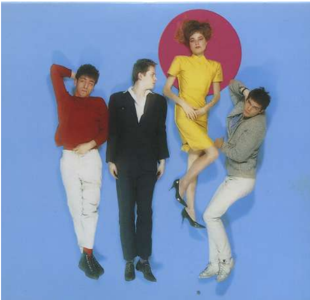
The Stinky Toys, 1979 © Pascal Carqueville

All these works are hosted in an innovative and radical design layout by Freaks Architecture, with an interplay of mirrors and interconnections based on a synchronisation of images and sound.